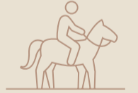
The Polo Fields