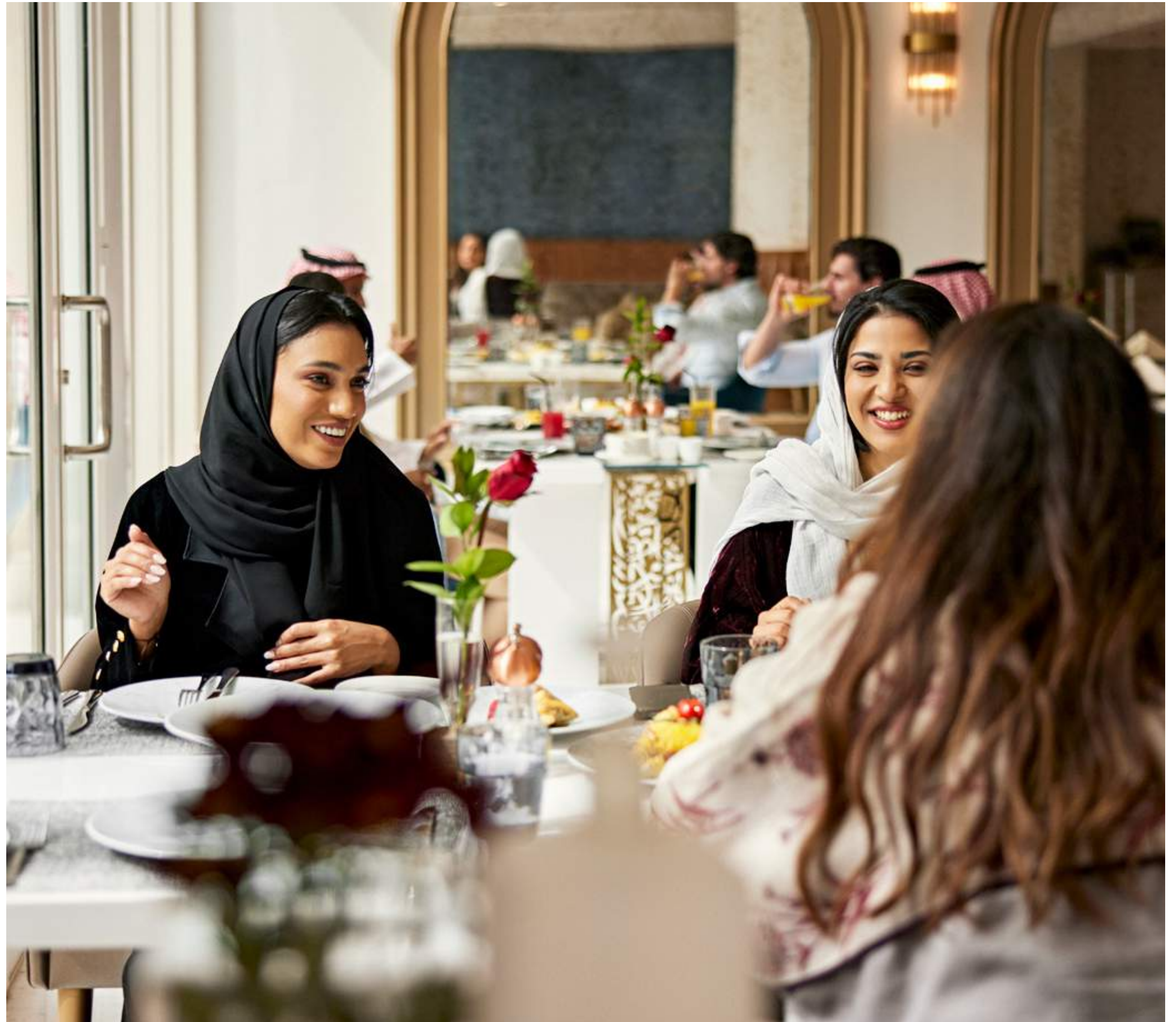
Retail & Dining