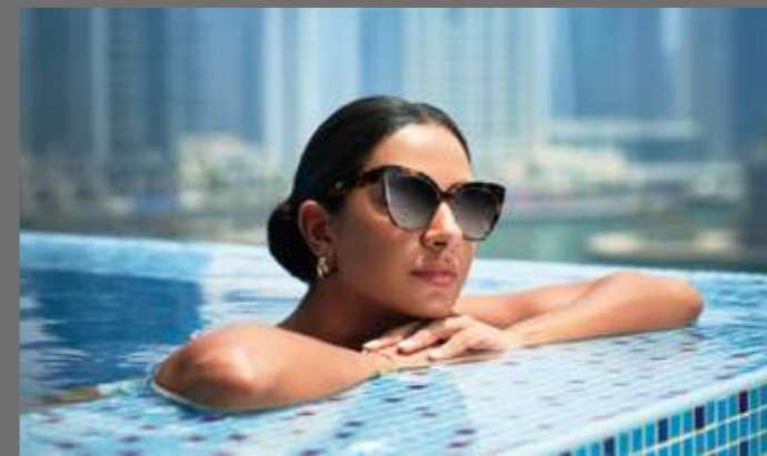
Lifestyle & Experiences