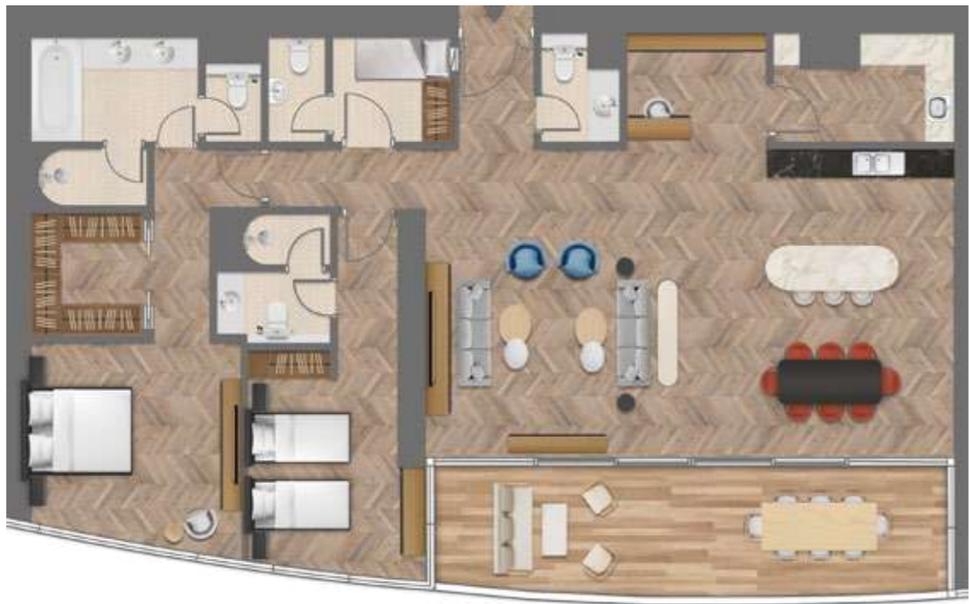
2 BEDROOM APARTMENT, TYPE C