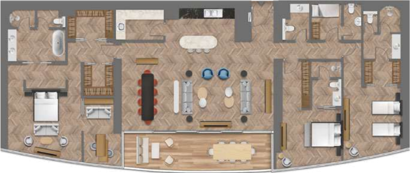
3 BEDROOM APARTMENT, TYPE C