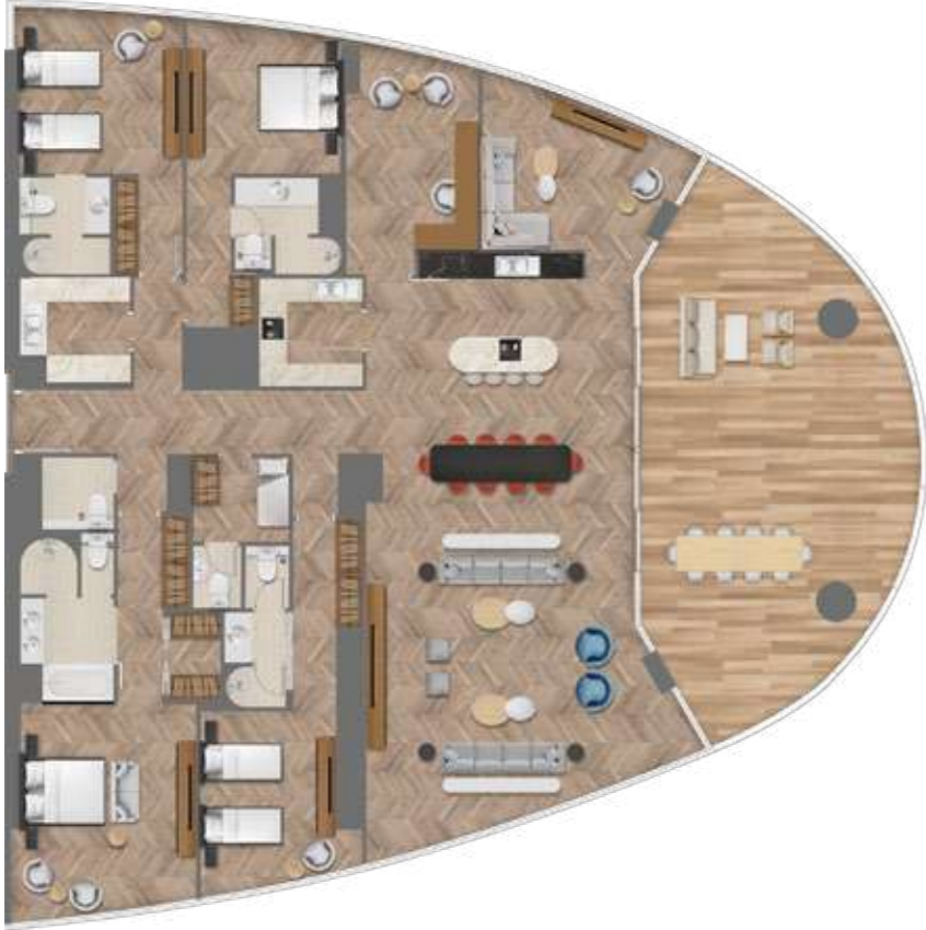
4 BEDROOM APARTMENT, TYPE A