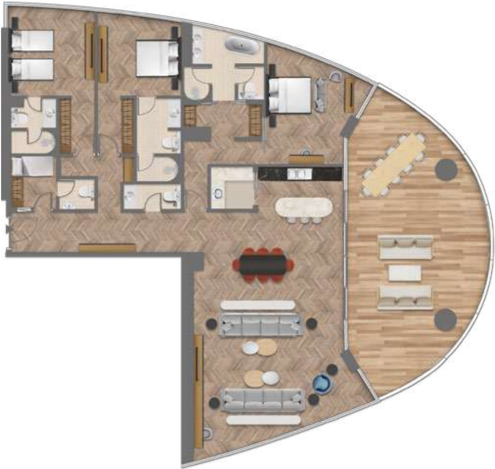
3 BEDROOM APARTMENT, TYPE B