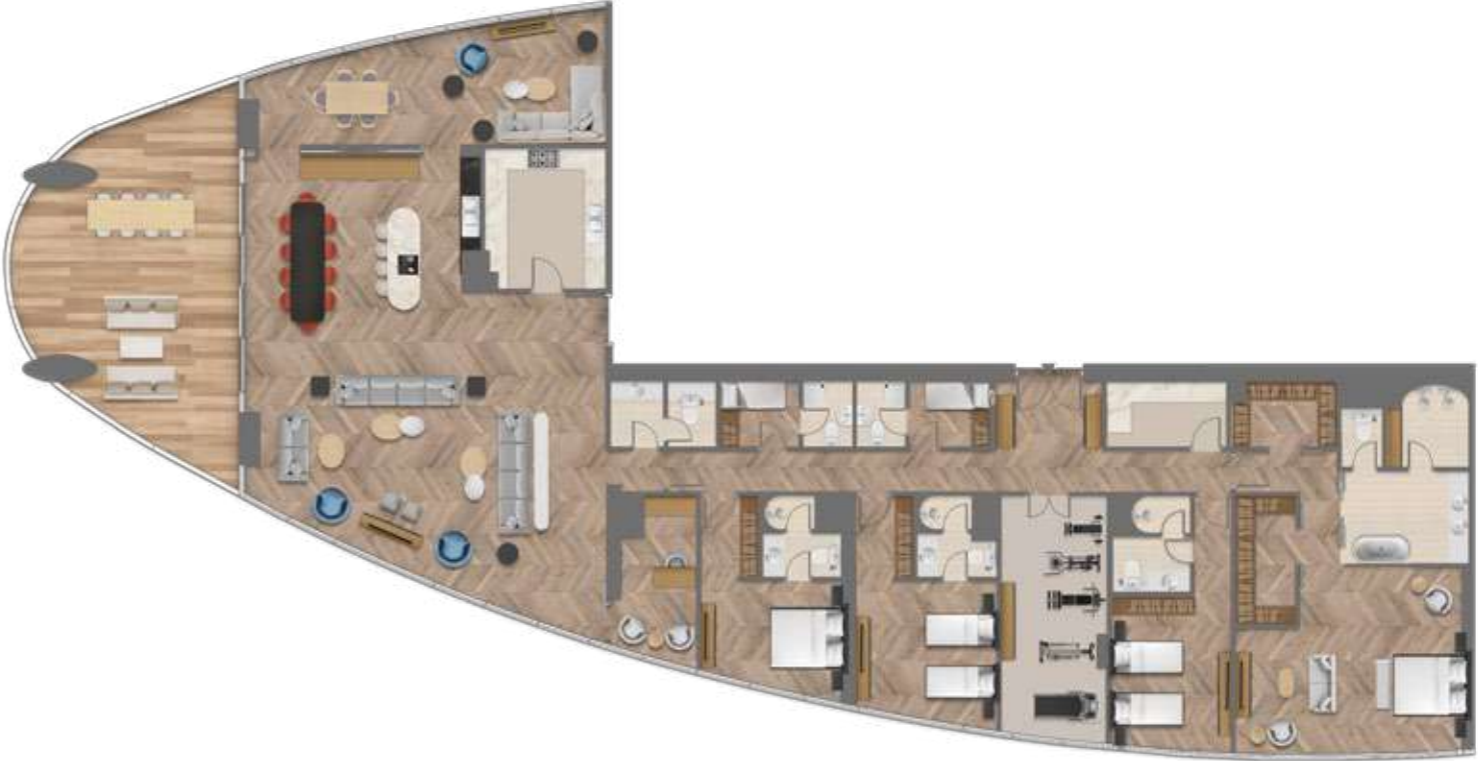
4 BEDROOM APARTMENT, SIMPLEX