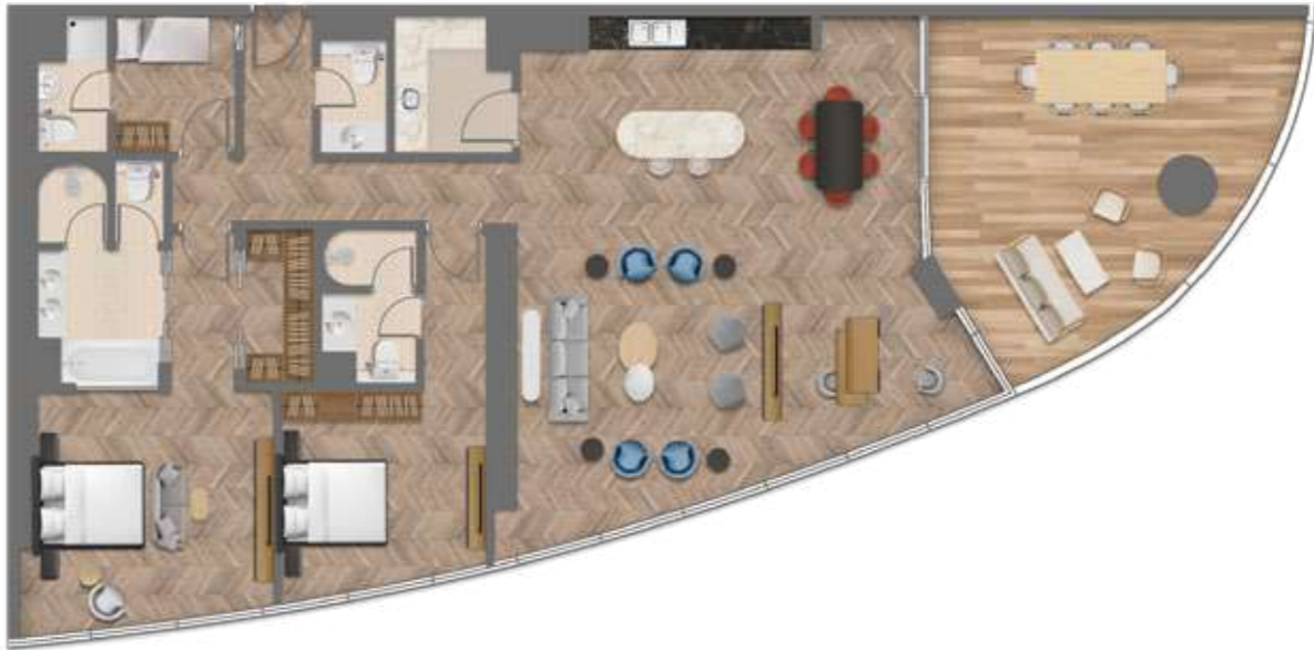
2 BEDROOM APARTMENT, TYPE B