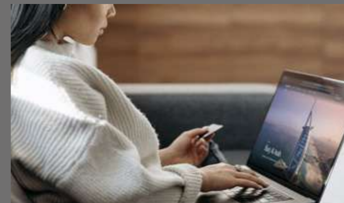
Pay with Points