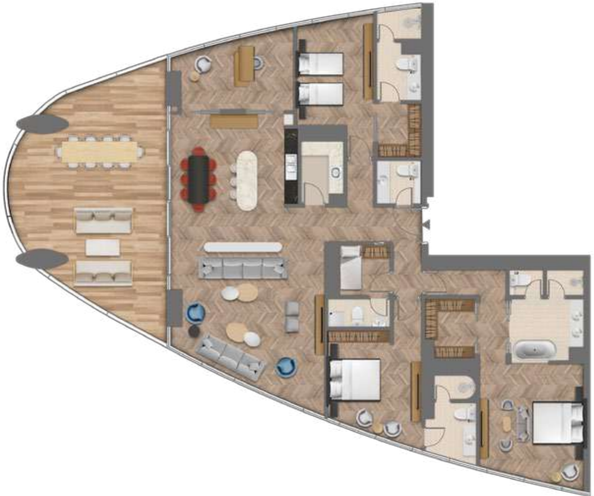
3 BEDROOM APARTMENT, TYPE A