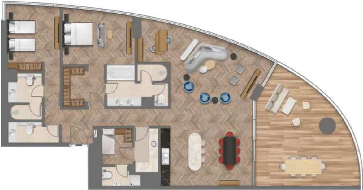
2 BEDROOM APARTMENT, TYPE A