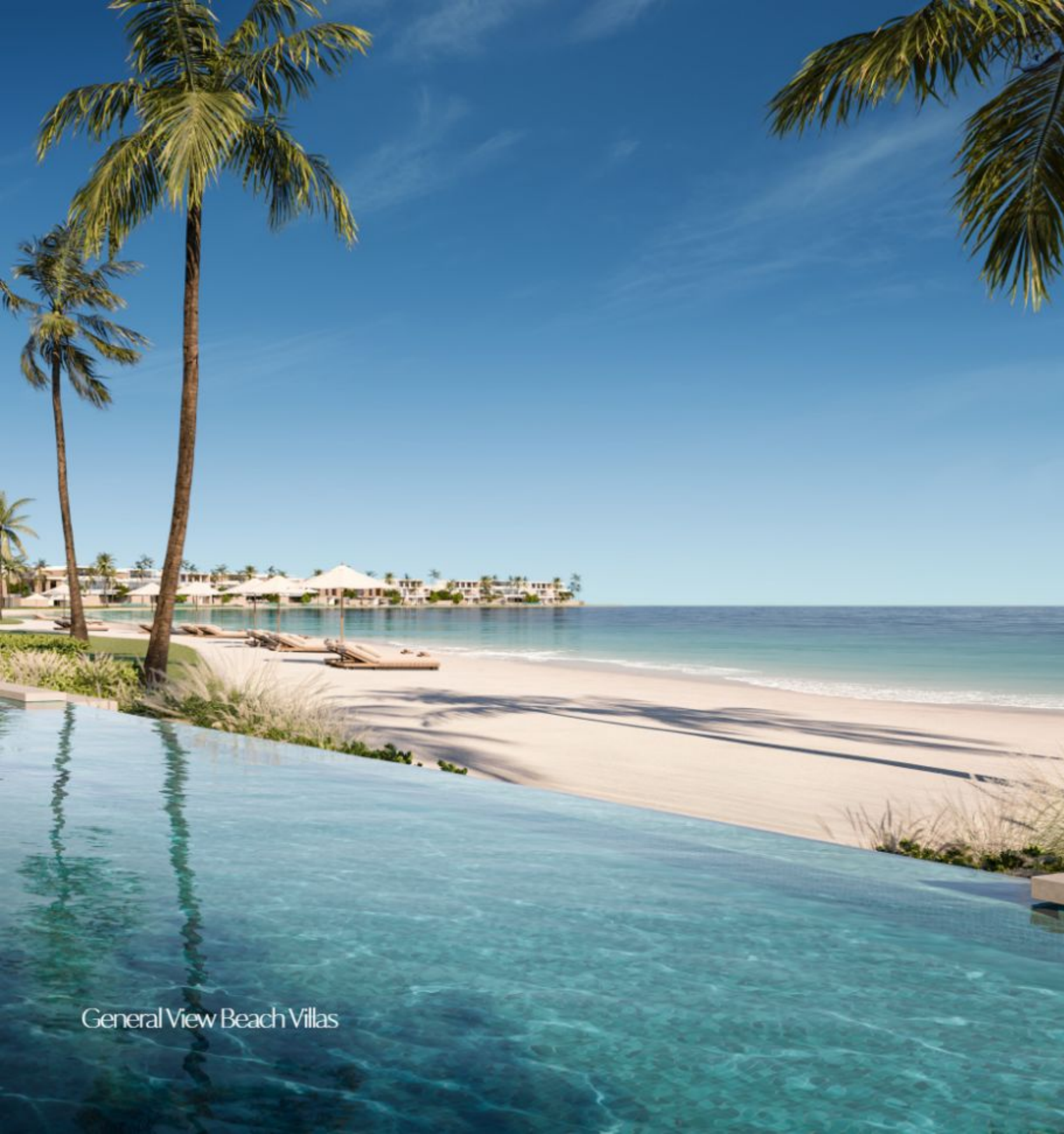
General View Beach Villas