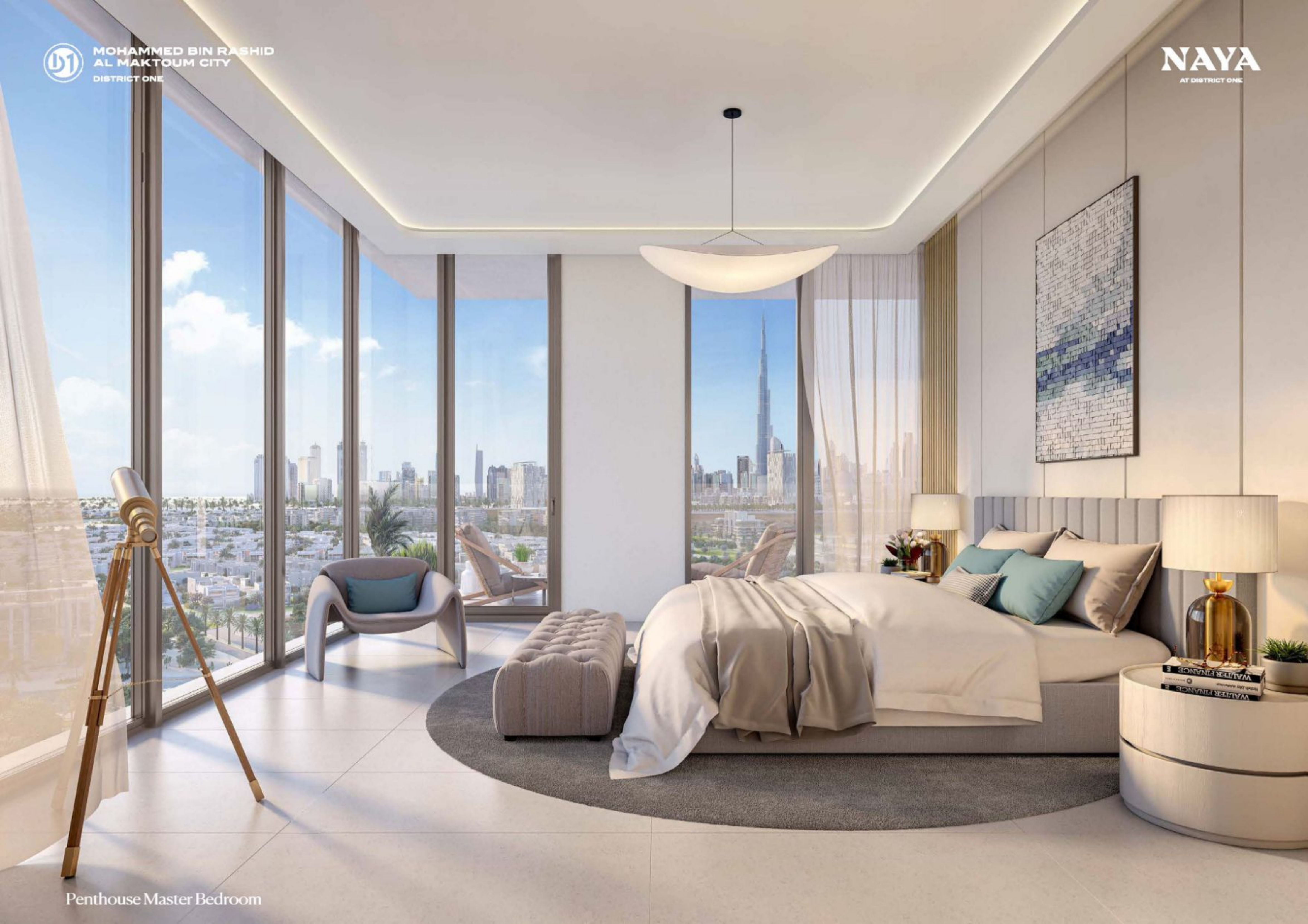
Penthouse Master Bedroom