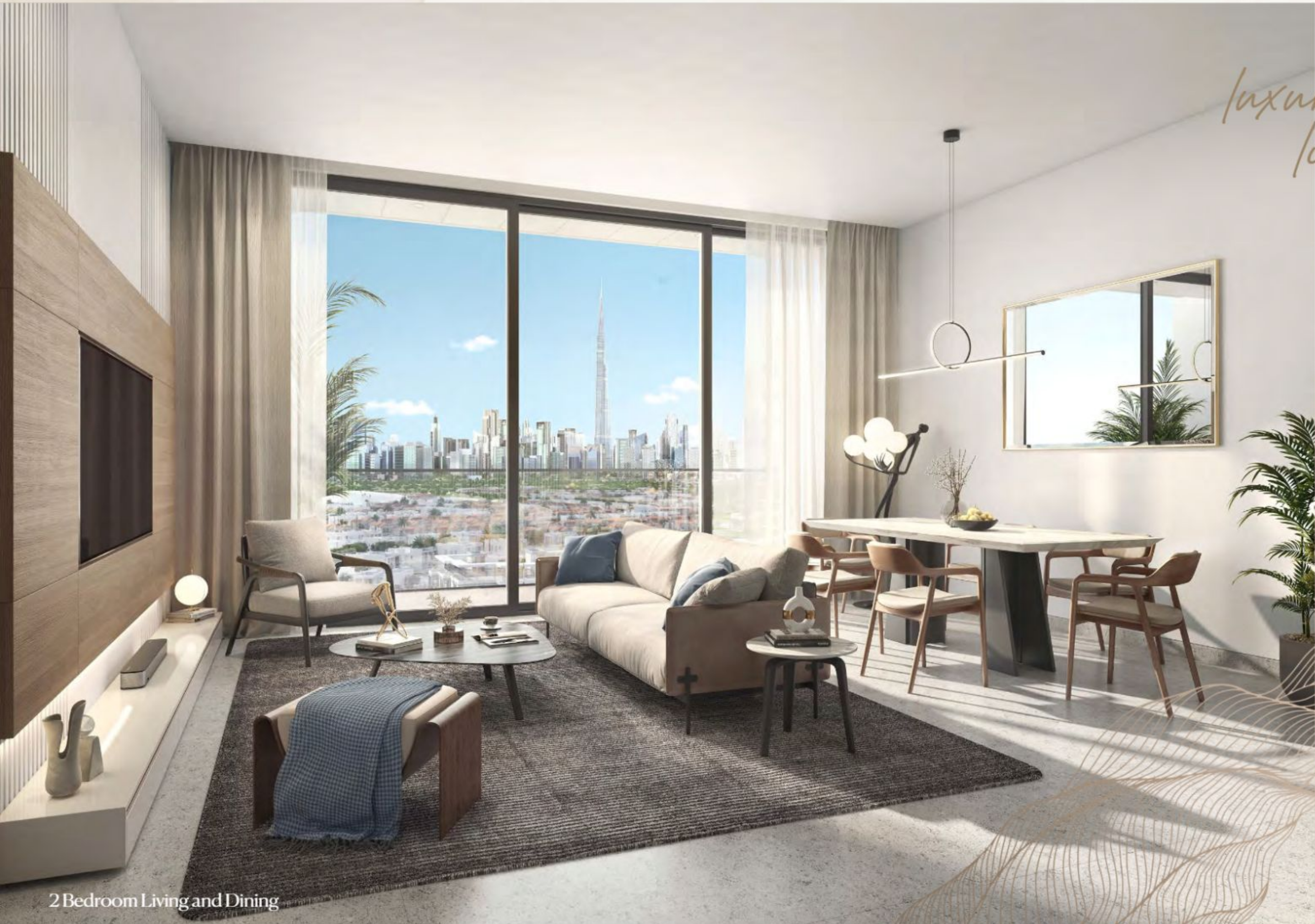
2 Bedroom Living and Dining