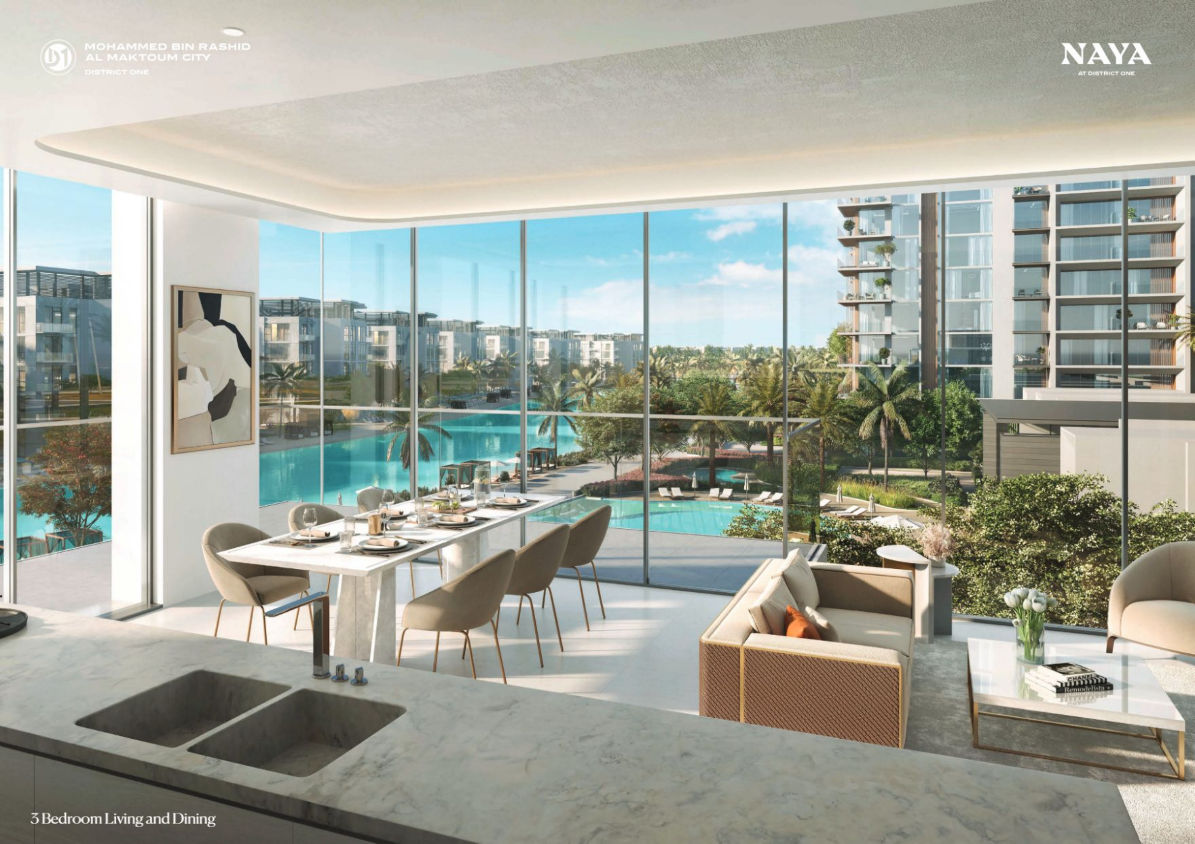
3 Bedroom Living and Dining