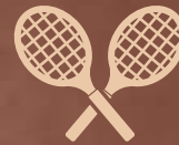
Squash & Tennis Court