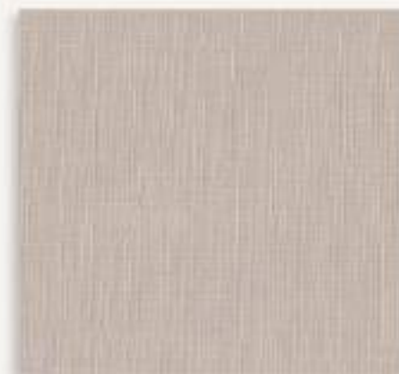
LAMINATE WARDROBE DOOR