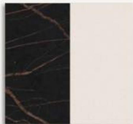
KITCHEN COUNTERTOP & BACKSPLASH