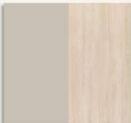
LAMINATE KITCHEN CAB.