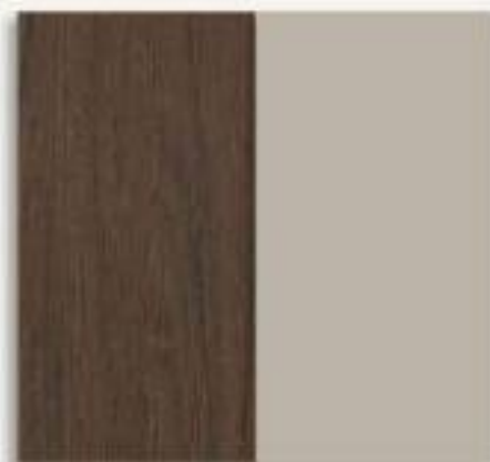
LAMINATE KITCHEN CAB.