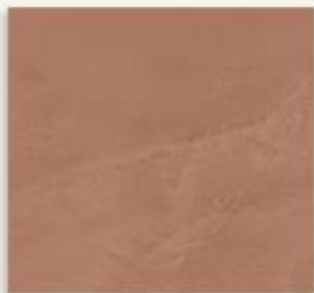
KITCHEN COUNTERTOP & BACKSPLASH