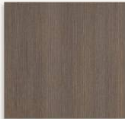
TIMBER DOOR JOINERY