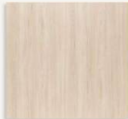
TIMBER DOOR JOINERY