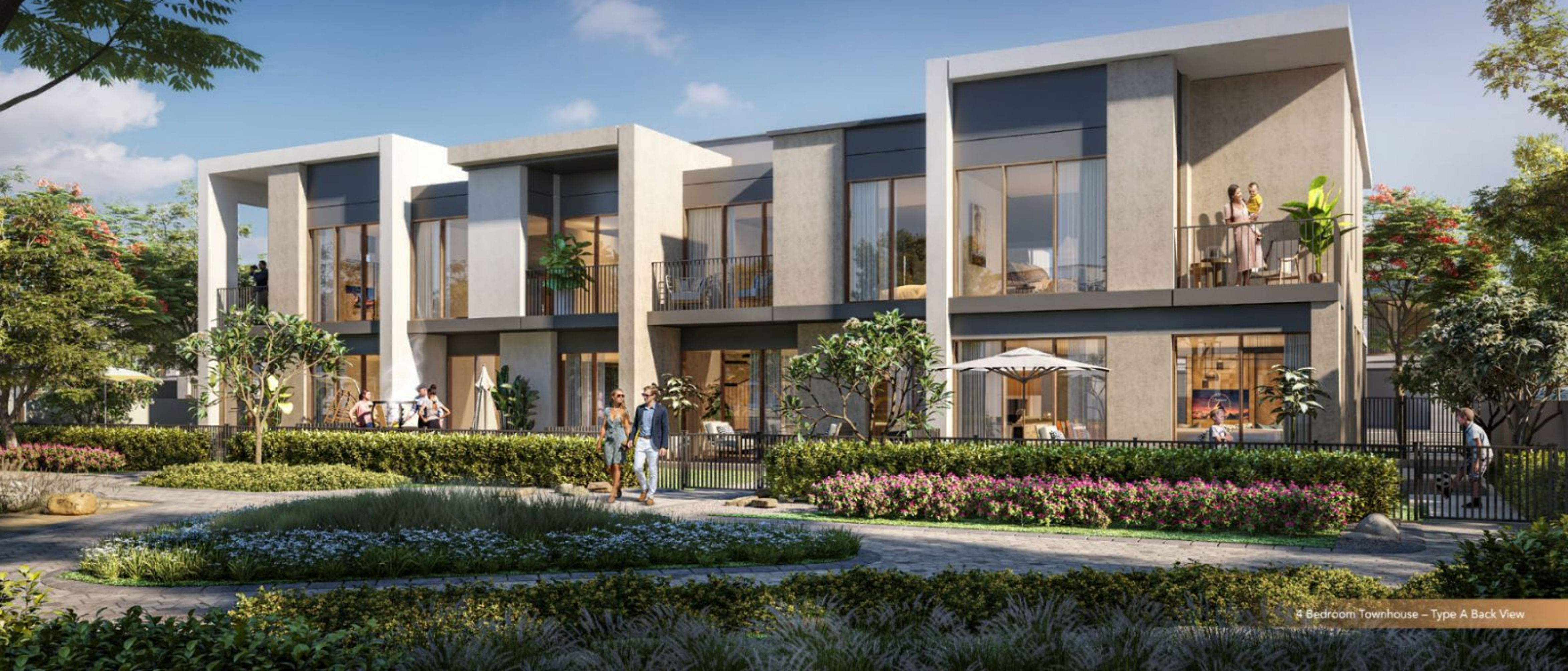
4 Bedroom Townhouse – Type A Back View

An outstanding collection of spacious 3 and 4 bedroom townhouses crafted to deliver a unique living experience.