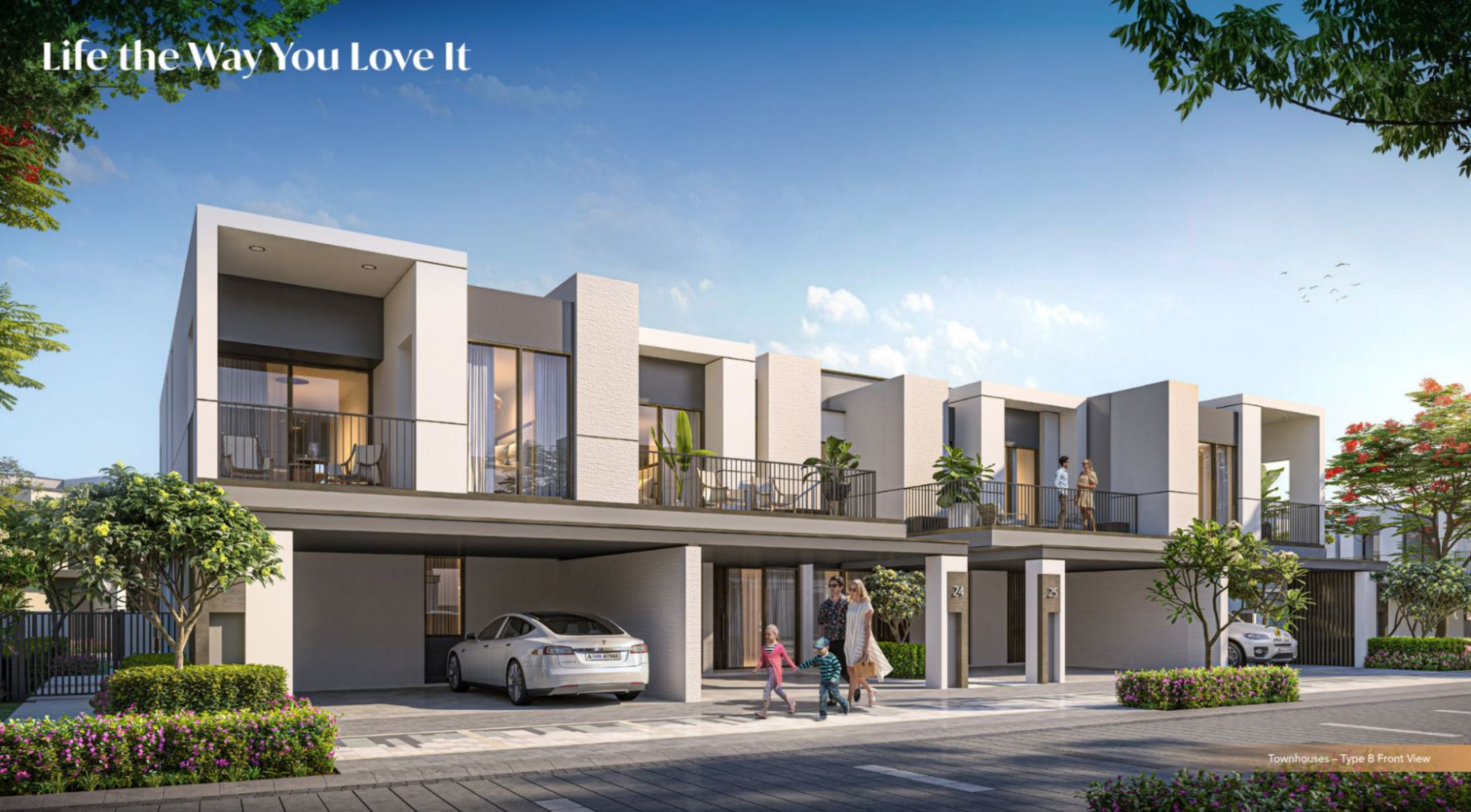
Townhouses – Type B Front View