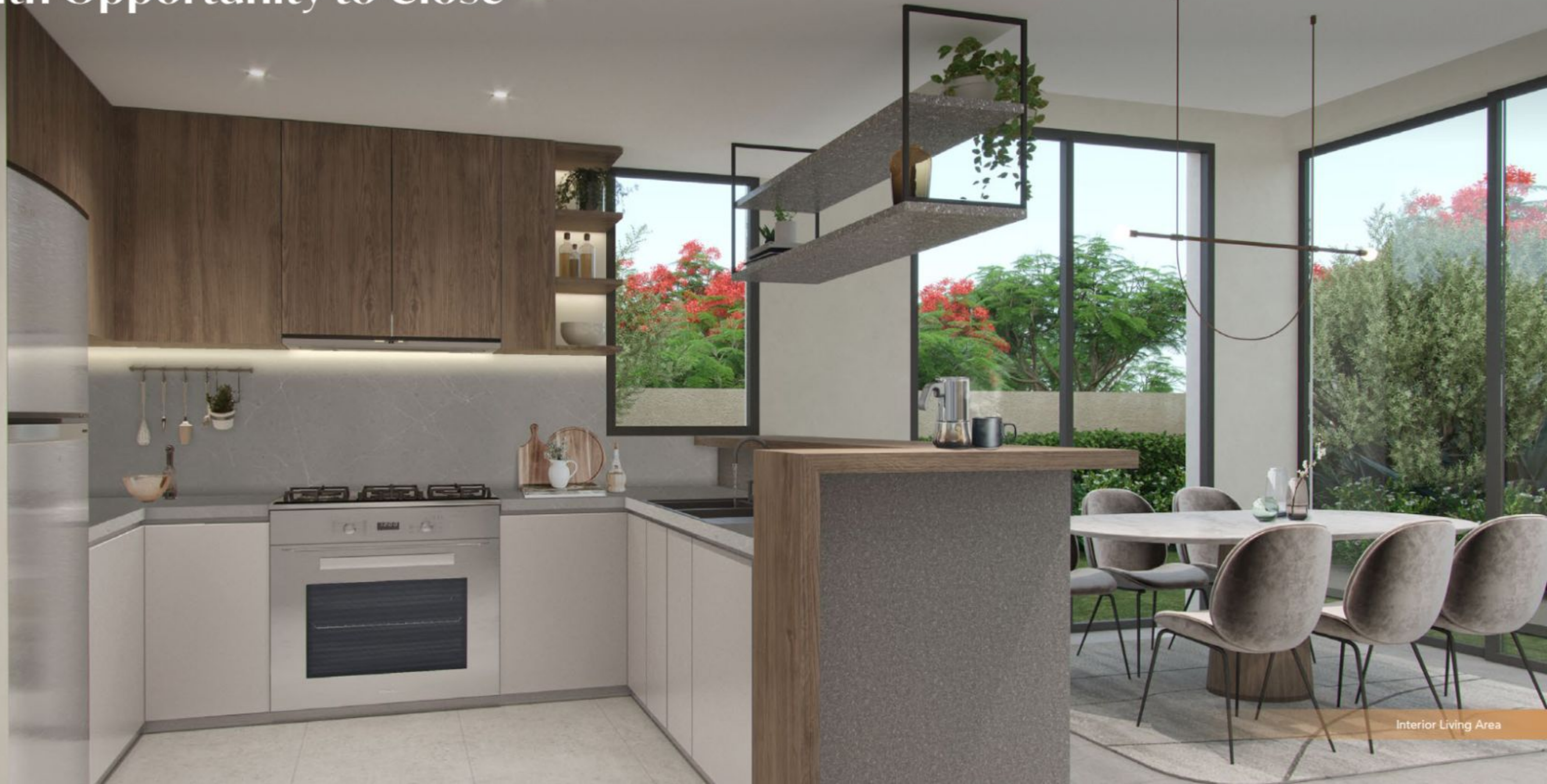
Interior Living Area