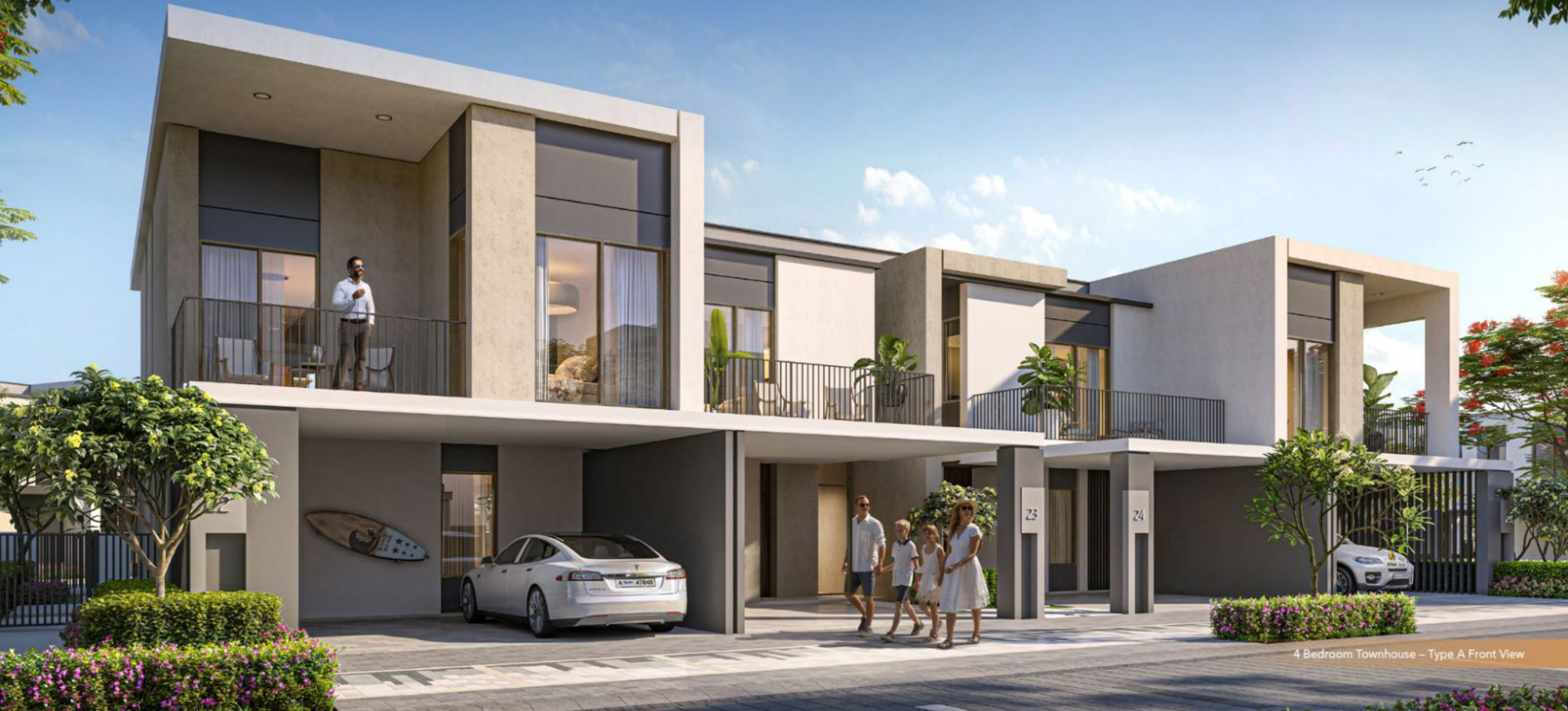
4 Bedroom Townhouse – Type A Front View