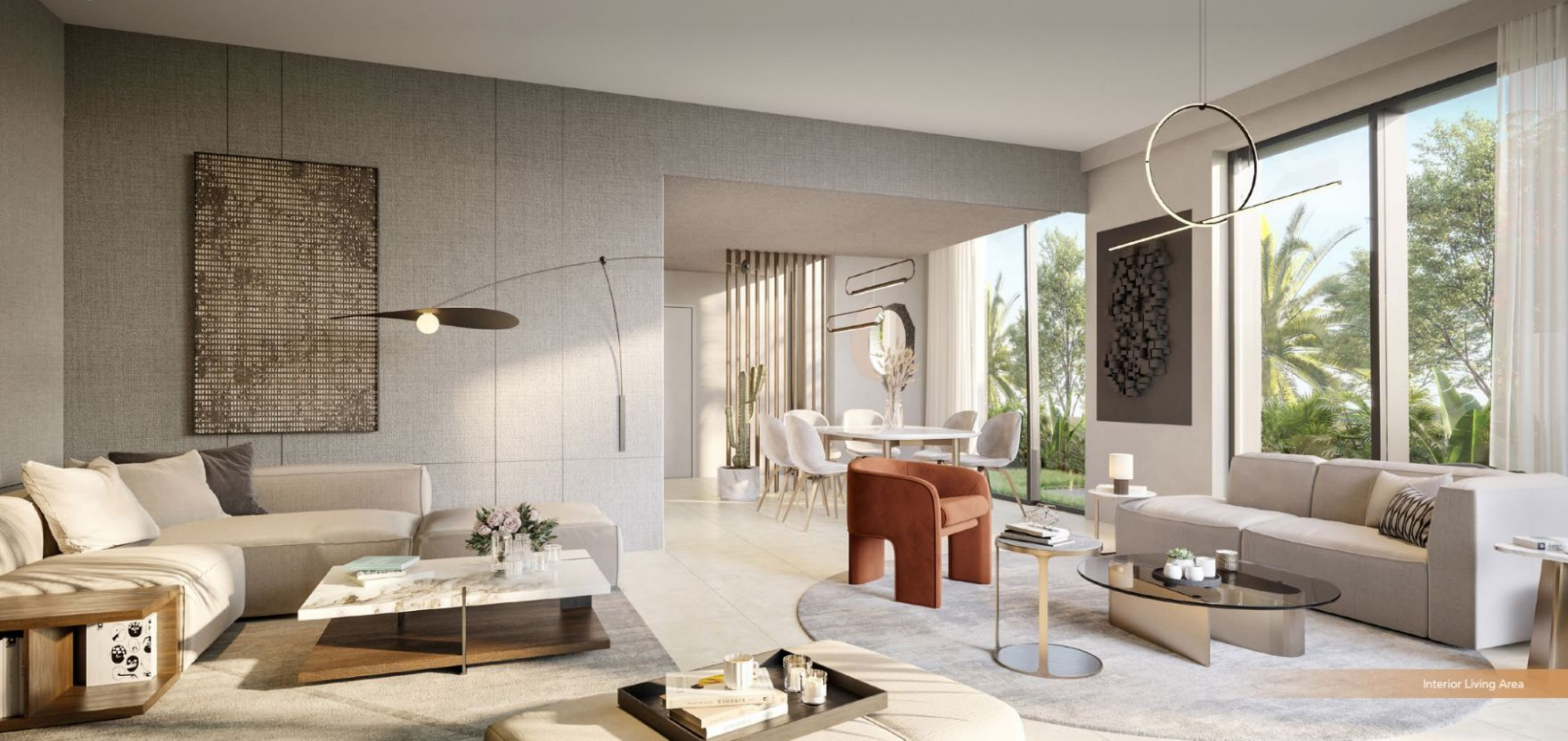
Interior Living Area