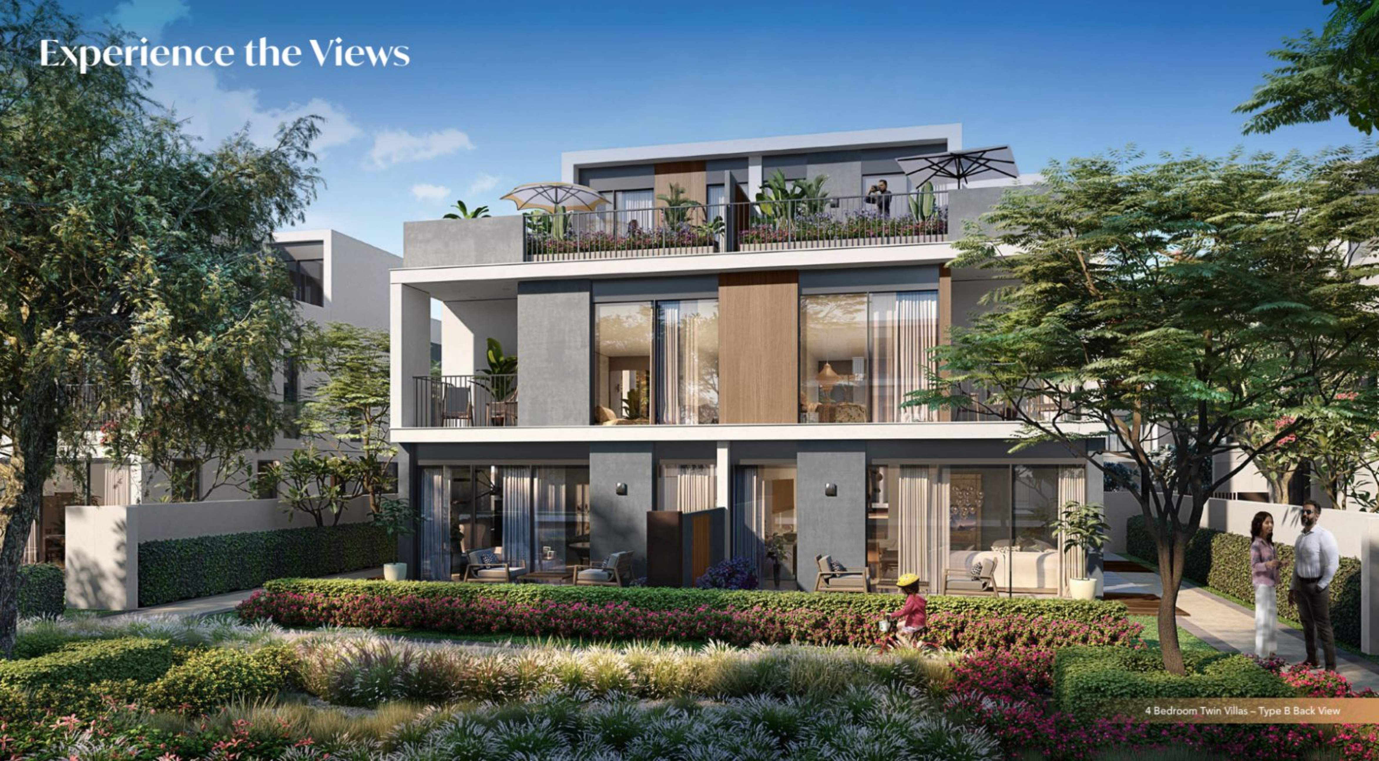
4 Bedroom Twin Villas – Type B Back View