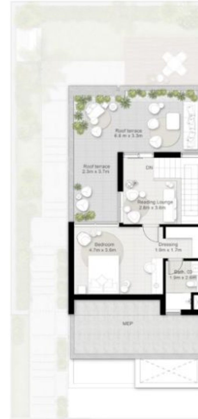
Option 2 – Entertain