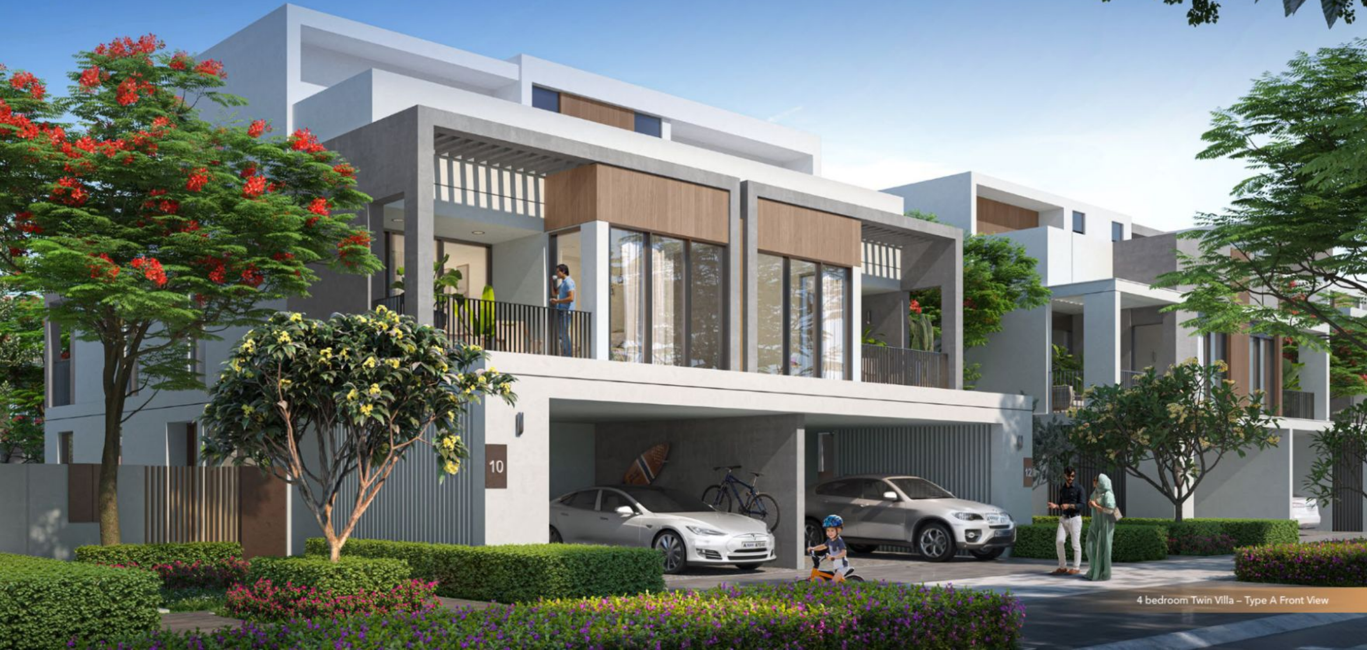
4 bedroom Twin Villa – Type A Front View