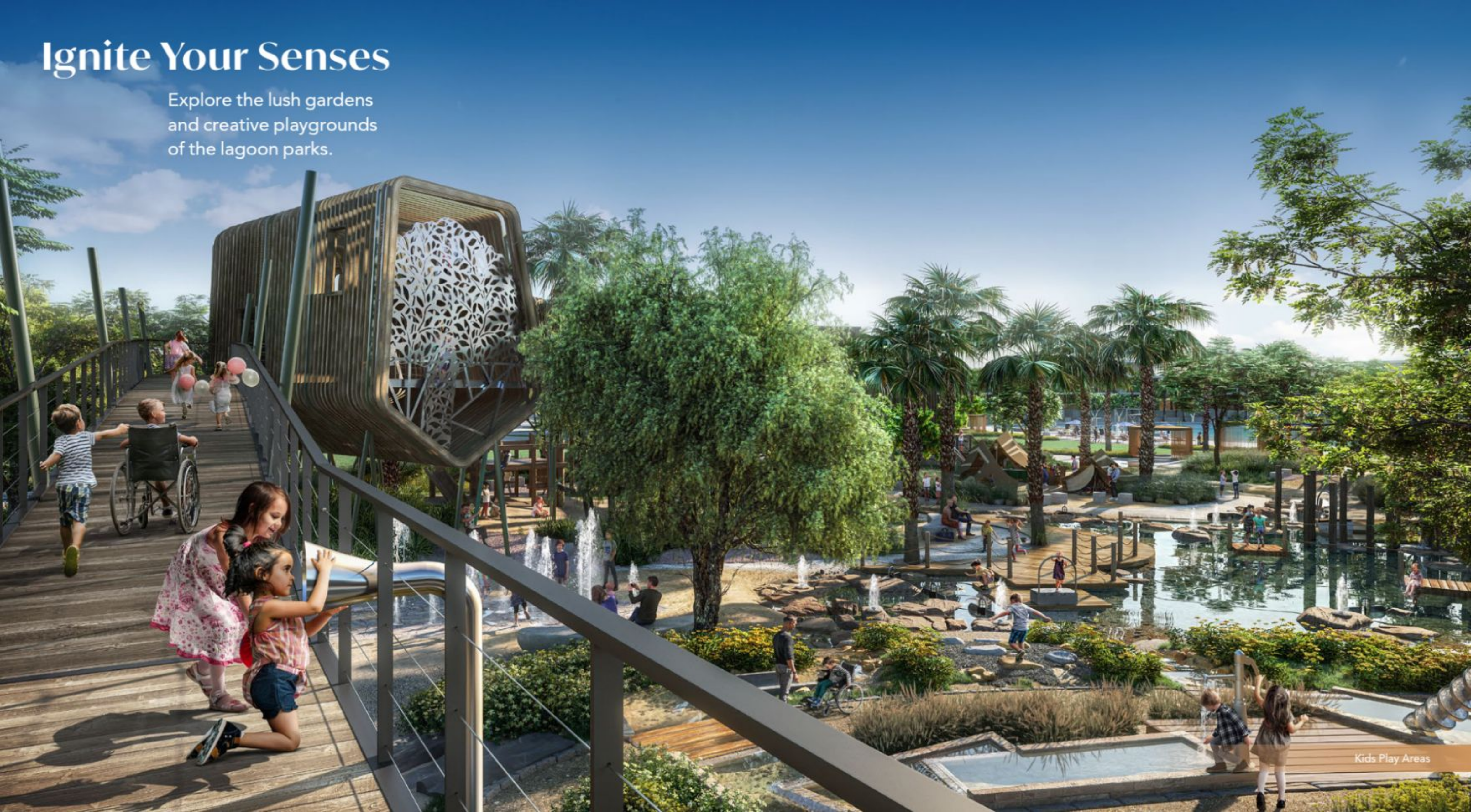
Kids Play Areas

Explore the lush gardens and creative playgrounds of the lagoon parks.