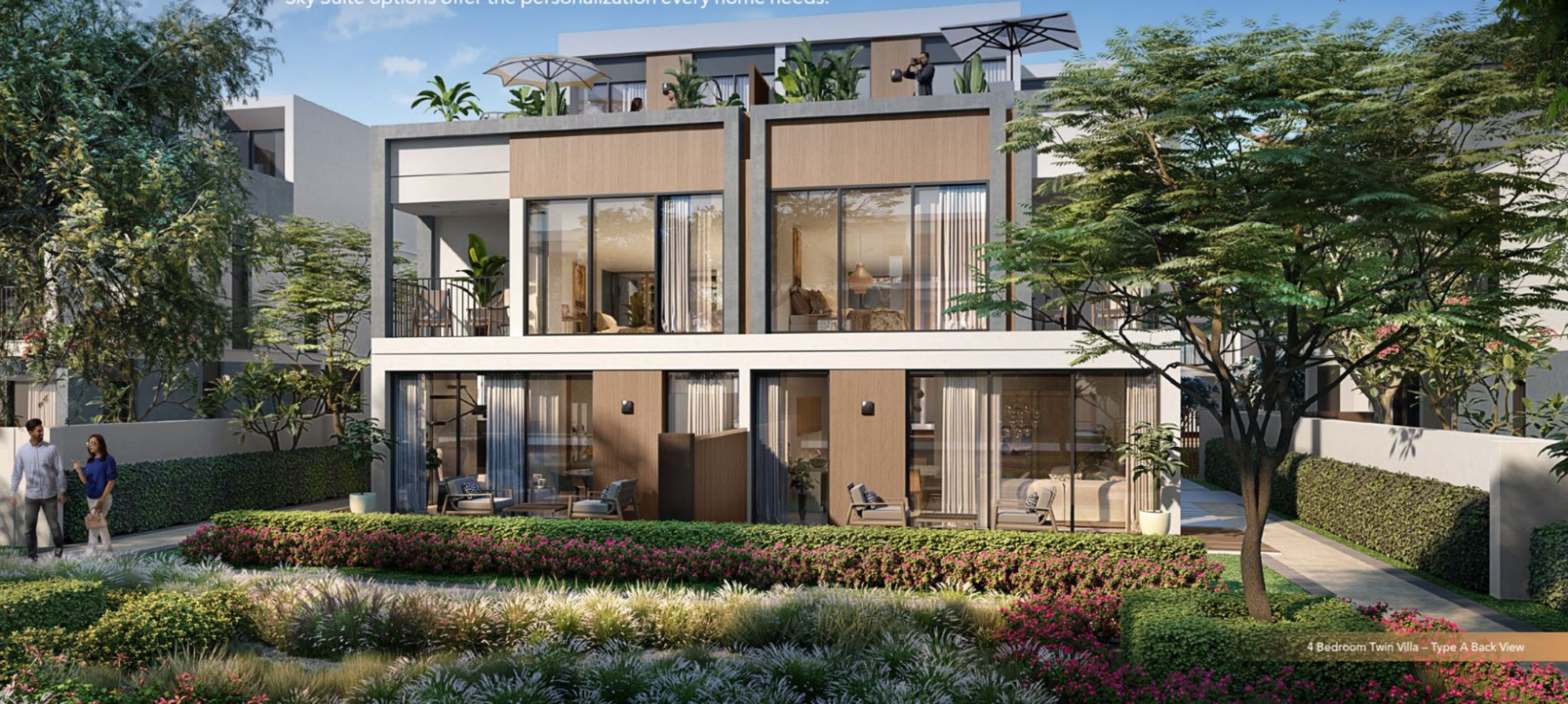
4 Bedroom Twin Villa - Type A Back View

Live life on your own terms with customizable living options. A choice of contemporary facades, functional interior layouts and exclusive Sky Suite options offer the personalization every home needs.