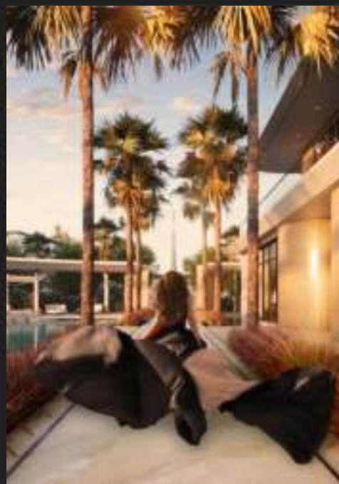
BRINGING NATURE INDOORS