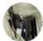
KARL'S FEATURE STAIR