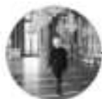
PARISIAN PARQUET FLOORING CHATEAU DE VERSAILLES