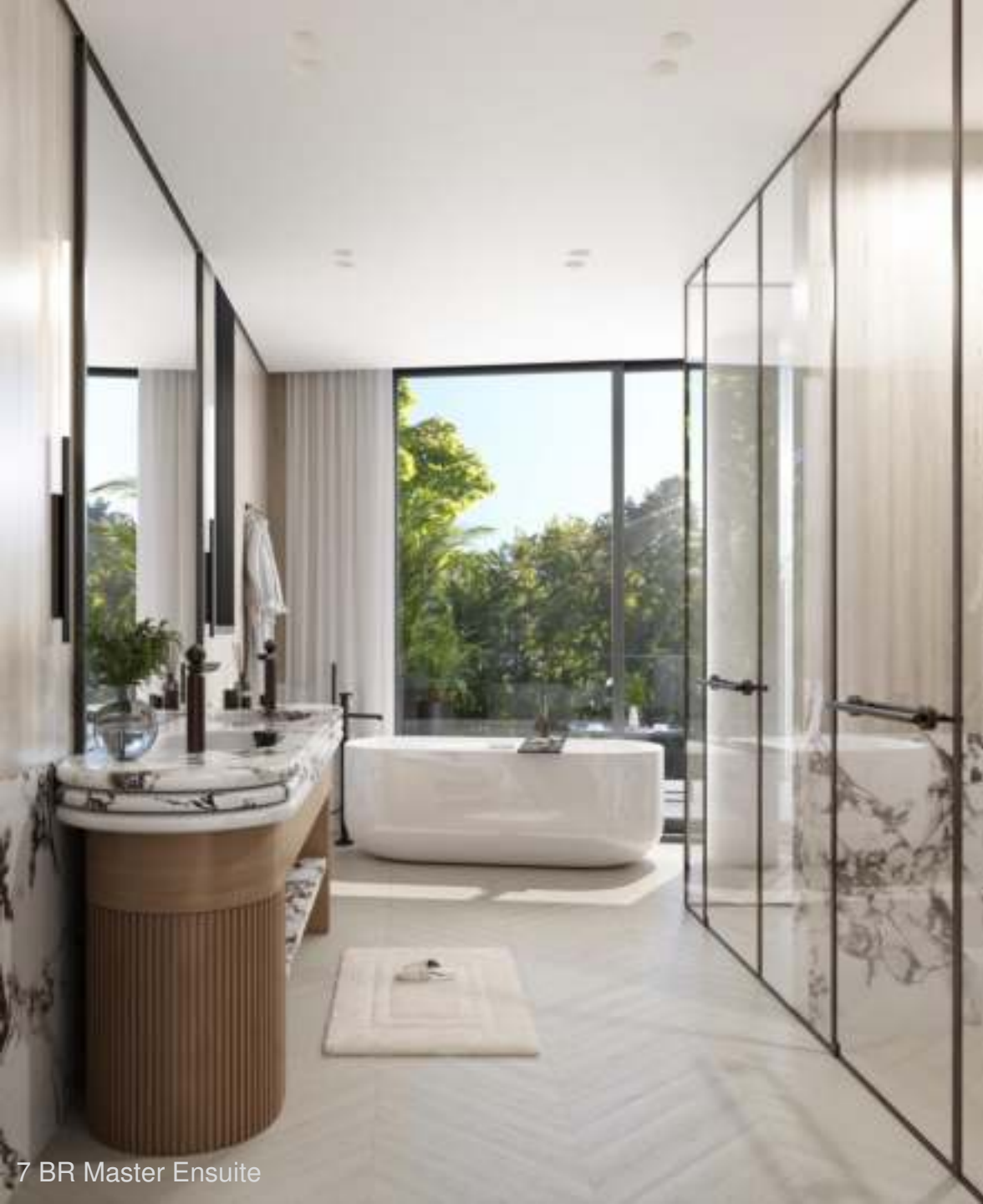
7 BR Master Ensuite