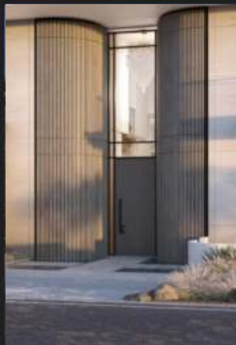
THE CELEBRATED RUNWAY