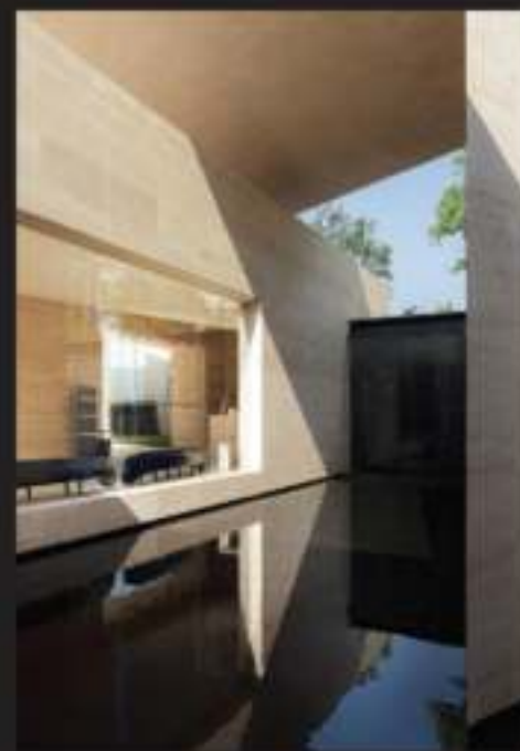
LAGERFELD'S REFLECTIVE AESTHETIC