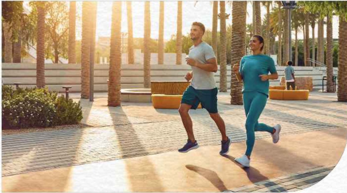
4.5 km of pedestrian tracks and 5.2 km of cycling trails