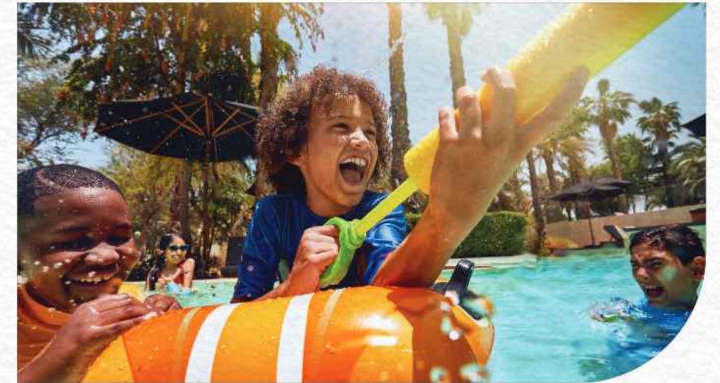
Swimming pools, splash pads and kids' play areas