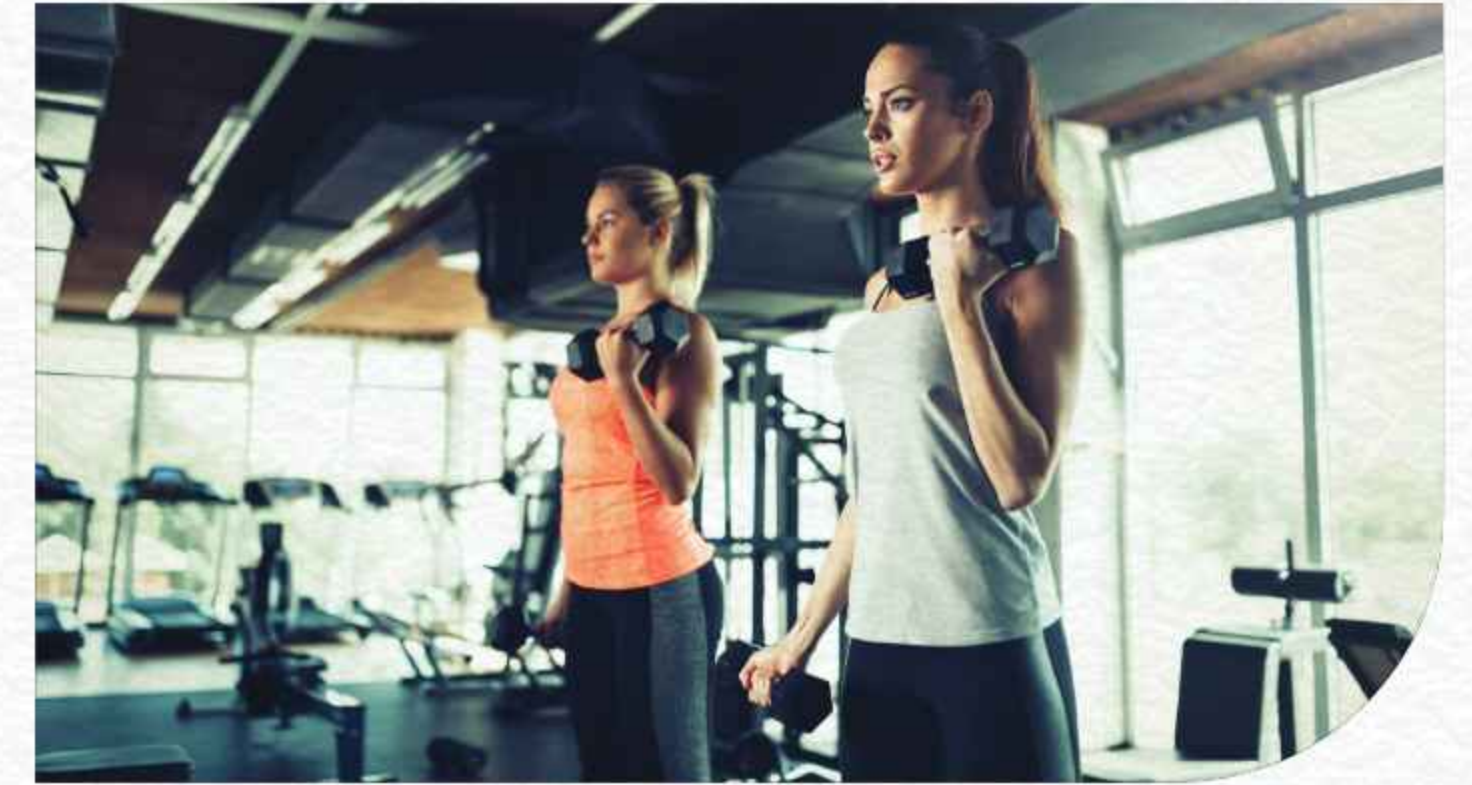
Gyms, outdoor wellness and fitness areas