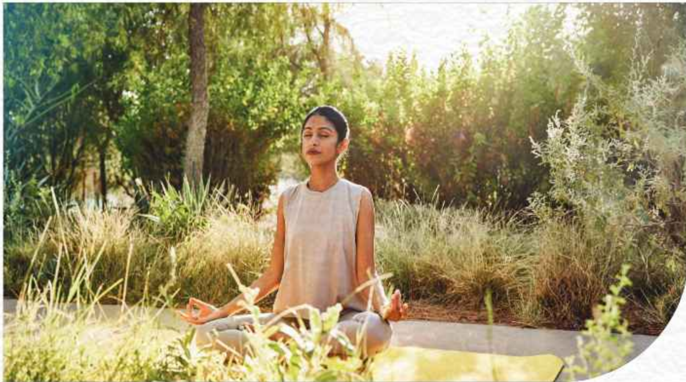
Yoga studio, health & beauty salon, spa and sauna