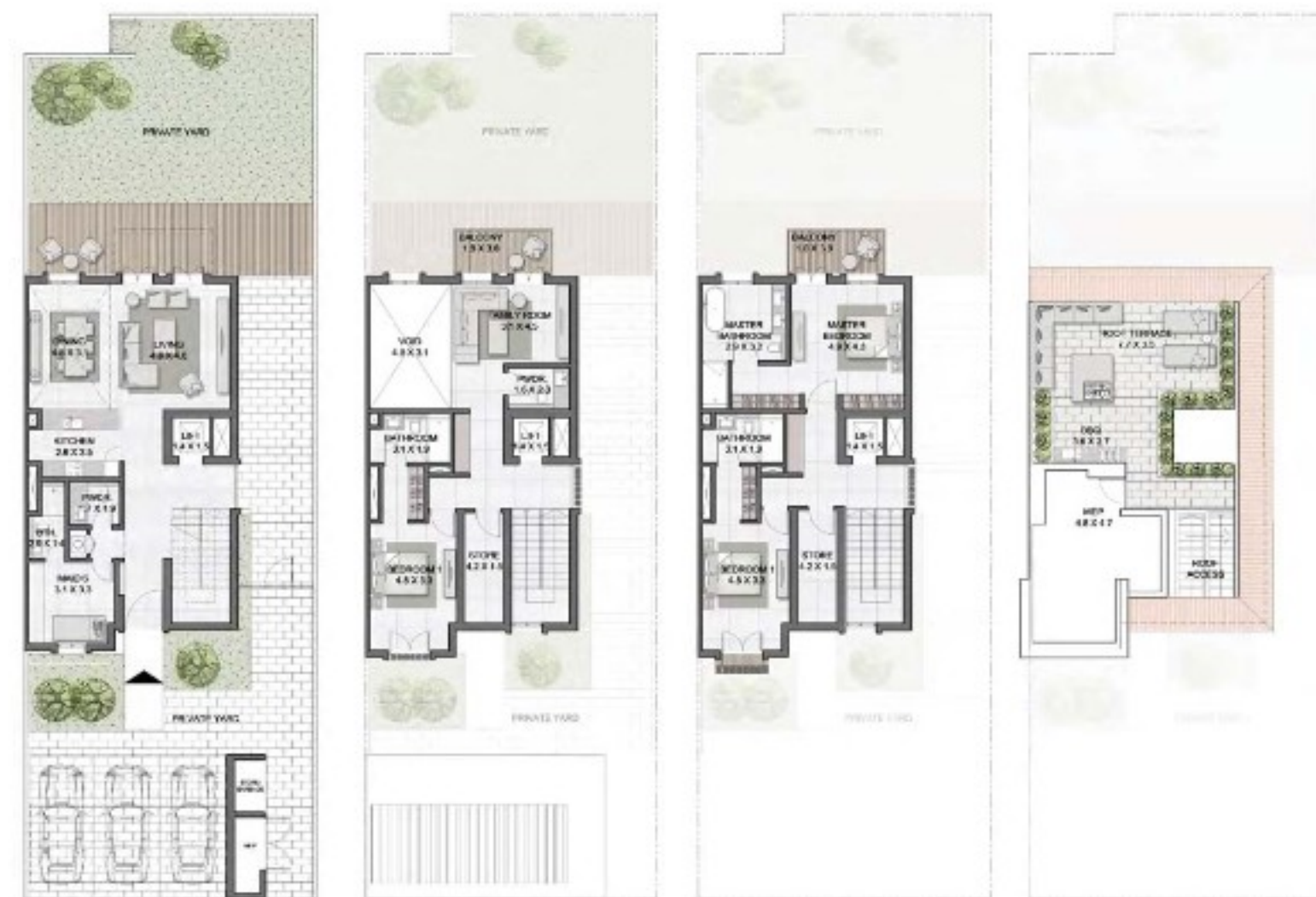
G. FLOOR 1. FLOOR 2. FLOOR ROOF