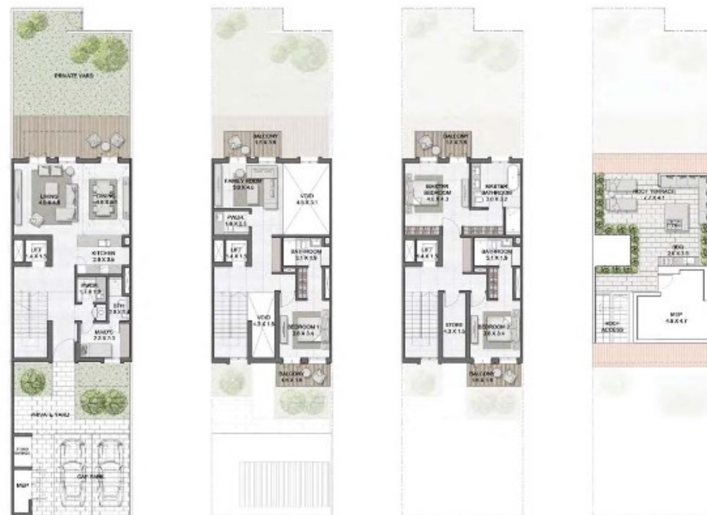
G. FLOOR 1. FLOOR 2. FLOOR ROOF